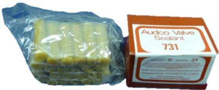
731 Sealant - D Stick