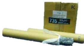
735 Sealant - K Stick