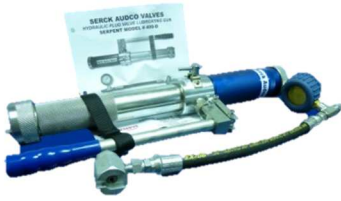
400-D Sealant Gun