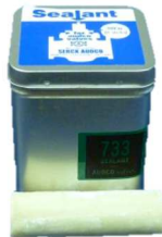
733 Sealant - G Stick in Tin