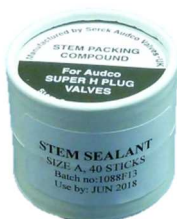
Stem Compound - A Size