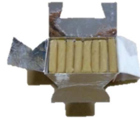
731 Sealant – B Stick