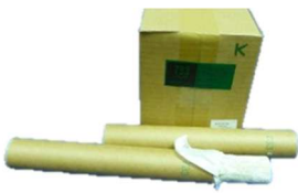
733 Sealant - K stick