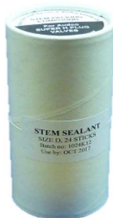
Stem Compound - D size