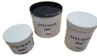
Anti Seize Compound