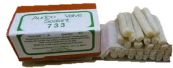
733 Sealant – A Stick